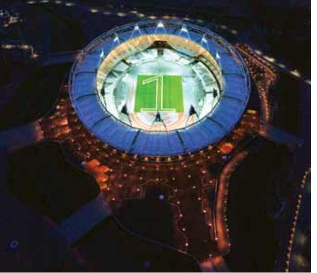
London Olympic Stadium won't have its test event until the British University & Colleges Sport Championships in May 2012.

"I'm glad that we have a few more months yet," he says, "but it will pass very quickly."