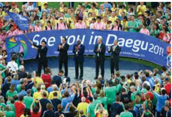
Organizers of the 2009 IAAF World Championships in Berlin set the bar high for Daegu 2011, then handed the flag over to its South Korean leaders.

PW: It was a difficult decision to take and the vote of our Congress was far from unanimous. That being said, we have now almost two seasons of experience behind us, and we can say that it was a wise decision: athletes accommodated this new situation, and results are continuing to improve.