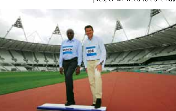
LOCOG chairman Sebastian Coe shows around IAAF president Lamine Diack during an Aug. 5 visit to London Olympic Stadium. The track should be completed any day now.

SC: Track and field has been the blood of this country, and I absolutely believe that in front of full houses and noisy passionate fans - and British athletics fans are as knowledgeable as they get - then we've got a good chance to bequeath a really memorable track and field celebration at the London Olympics.